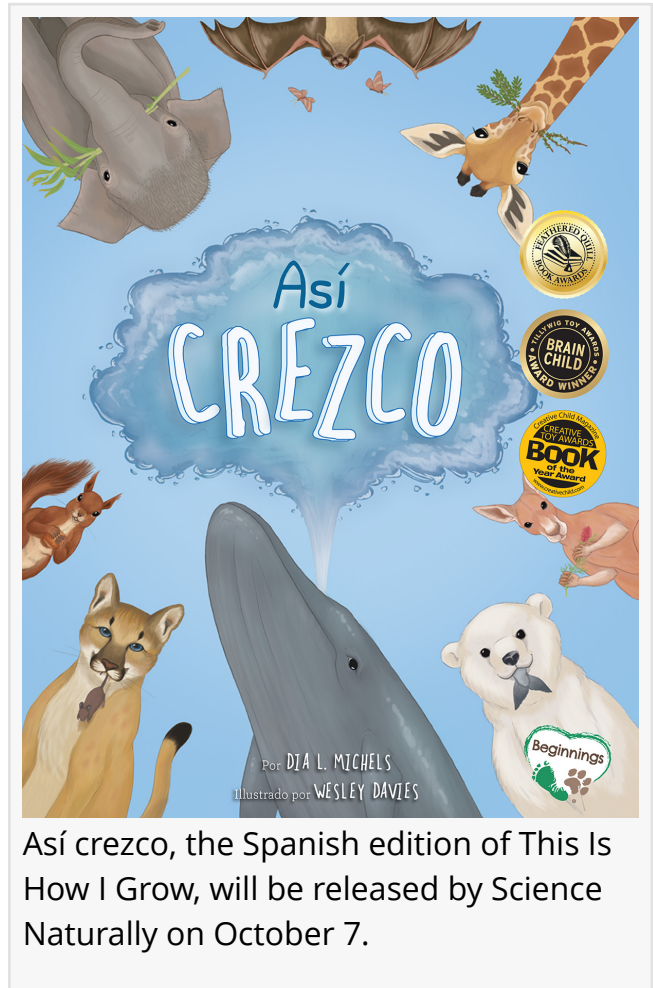
Así crezco , the Spanish edition of This Is How I Grow , will be released by Science Naturally on October 7.