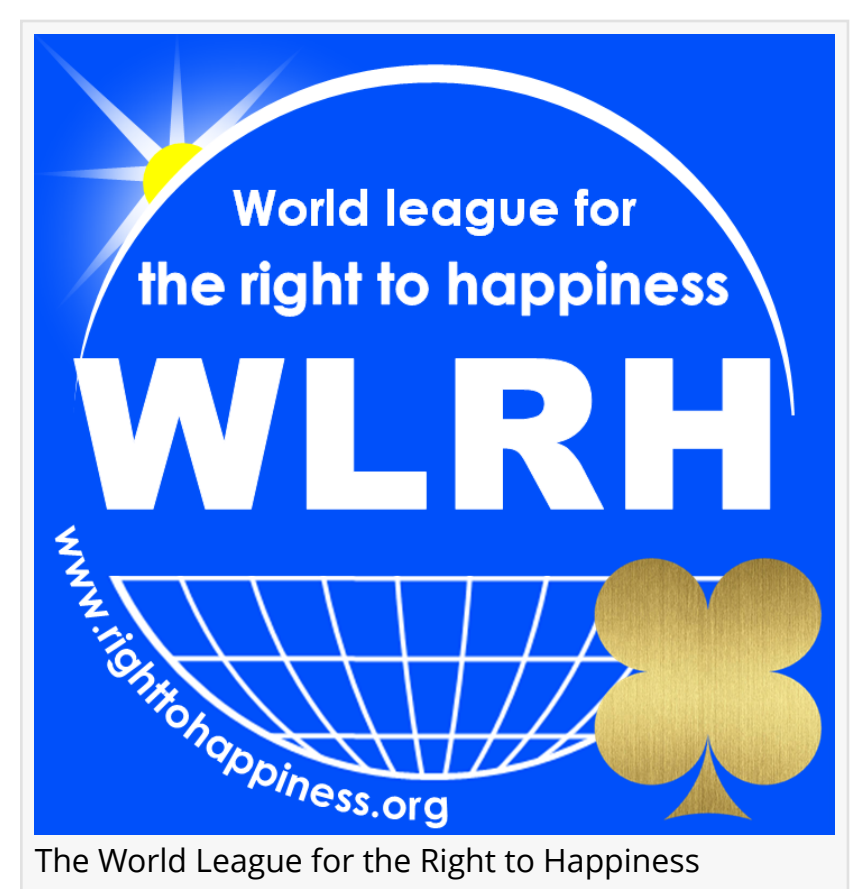
The World League for the Right to Happiness