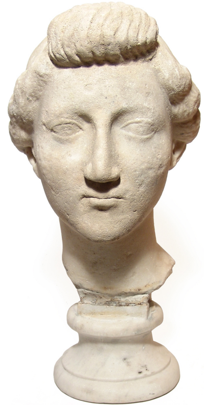
Lovely Roman marble head of a woman from the Julio-Claudian Period (circa early 1st Century BC), in the manner of the Empress Livia Drusilla (aka Julia Augusta). (est. $9,000-$12,000).

The Roman marble head of a woman from the Julio-Claudian Period was rendered in the manner of the Empress Livia Drusilla (also known as Julia Augusta). Her features are well-defined, with pursed lips and rolled curls at her forehead and framing her face. The partially restored head is attached to a marble base, with an overall height of 15 ¾ inches. It should bring $9,000-