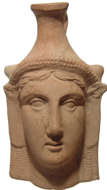
Greek pottery plastic vase depicting a female head, circa 4th C. BC, with youthful features modeled with plump lips and wide eyes, 5 ½ inches tall (est. $3,000-$4,000).

Gabriel Vandervort Ancient Resource Auctions +1 818-425-9633 email us here