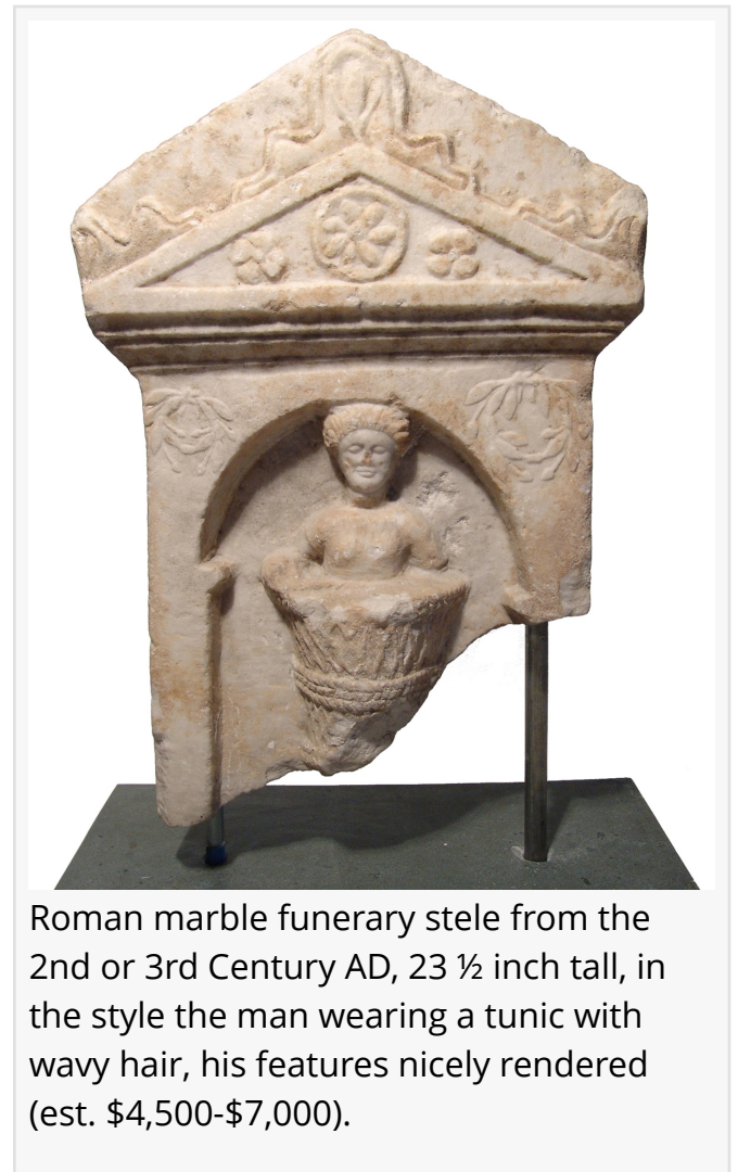
Roman marble funerary stele from the 2nd or 3rd Century AD, 23 ½ inch tall, in the style the man wearing a tunic with wavy hair, his features nicely rendered (est. $4,500-$7,000).

single handle attached to rim and shoulder, should fetch $600-$900. The 8 ¼ inch tall vessel is decorated with stylized fish flanking a central medallion with concentric circles.