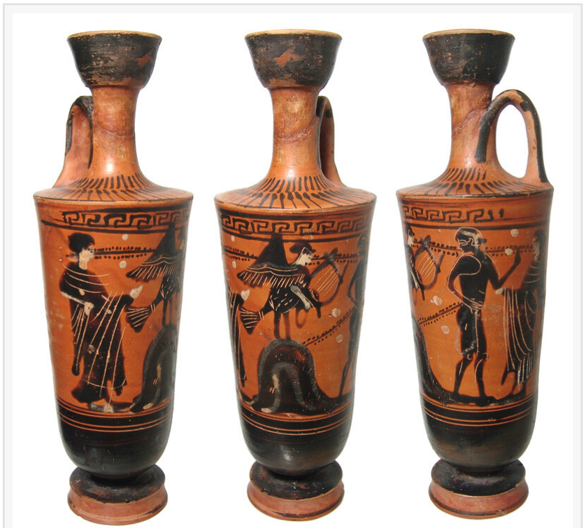
Composite photo of a circa 500-460 BC Greek black-figure lekythos, a fine example with light deposits, featuring a siren holding a lyre standing atop a mound (est. $3,500-$5,000)

All lots may be viewed and bid on now, via Ancient Resource Auctions' bidding platform, at bid.AncientResourceAuctions.com , and on its bidding apps for both Android and Apple devices. Bids can also be placed on Invaluable.com and LiveAuctioneers.com . A link to LiveAuctioneers is at https://www.liveauctioneers.com/catalog/178626_a87-fall-exceptional-antiquities-sale/?pageSize=all .