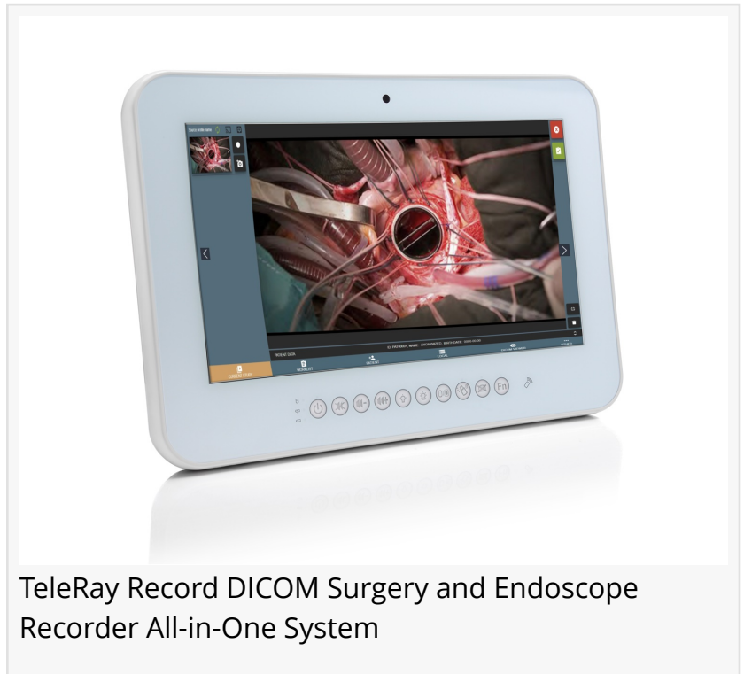
TeleRay Record DICOM Surgery and Endoscope Recorder All-in-One System

EINPresswire.com/ -- Palo Alto, CA September 23rd, 2020 – Nautilus Medical Technologies has just announced an advanced all-in-one surgery recorder, named TeleRay Record , for use with any endoscope, headset, c-arm, vascular, ultrasound, c-arms, and more. Users will be able to store up to 150 hours of HD medical videos from a high-tech medical touch screen PC with a larger screen than prior systems.