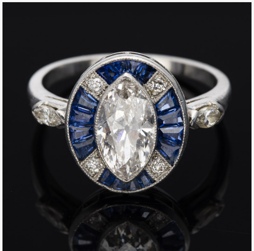
Art Deco platinum and sapphire dinner ring, 2.86 dwt with a D or E-color S1 central diamond. Estimate: $3,000-$5,000

rendering of a figure walking along a road with a sailboat and harbor in the distance. It has a Greer Gallery exhibition card on verso and is entered with an $800-$1,200 estimate.