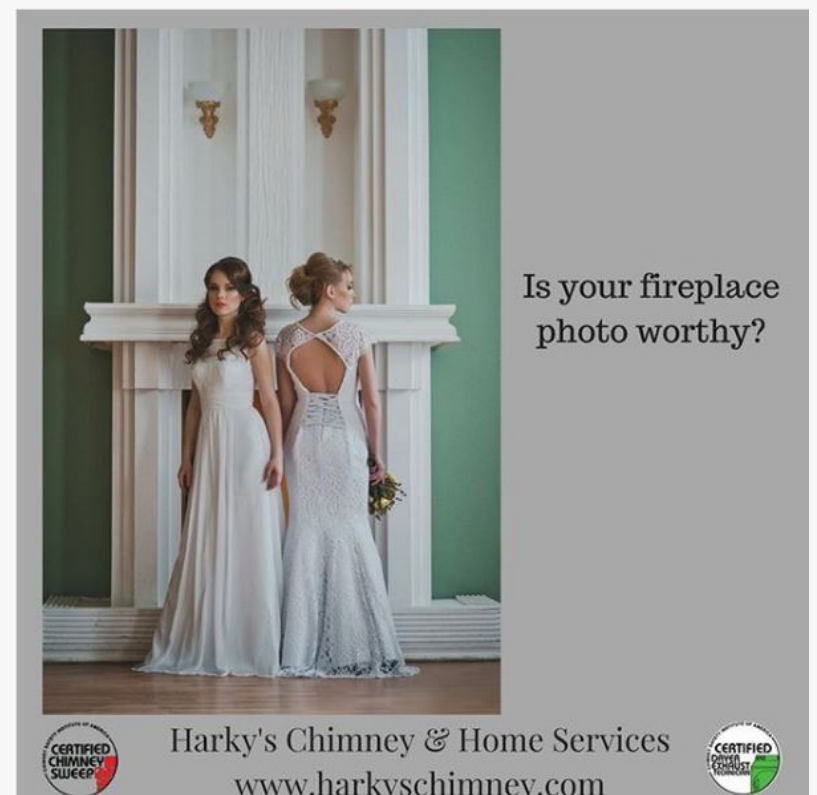
Is Your Fireplace Photo Ready?