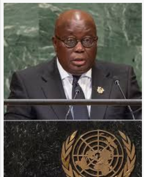
H.E. President Nana Akufo-Addo - President of Ghana, AU Gender Champion, UN He4She and ECOWAS CHAIR- Ghana Shows Concern for Domestic Workers in New Labour Regulations 2020, Legislative Instrument, LI 2408

Diasporan #ENDDEADLYWORK Coalition is a US based global grassroots campaign, an initiative of the Nekotech Center for Labour Migration Diplomacy with over 10,000 members of renowned world peace advocates, including former Presidents, universities, mega churches, world renowned institutions and Labour migration stakeholders across all racial and faith based lines, fighting together to ensure Kafala and all forms of forced labour are ended for Africans, especially migrant African women domestic workers.