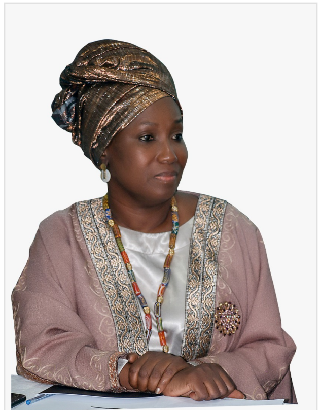
UNYA-GHANA Chairperson and International Best Selling Authour of Deadly Work or Decent Work?

In line with the UN75 Peace Day theme of "Shaping Peace Together" and in the spirit of "being our brother's keeper", the UNYA-GH and DEC are petitioning the Ghana Government and all African Leaders to protect migrant women domestic workers from abuse. In the short term, by urgently rescuing them and bringing them back to their home countries and by: