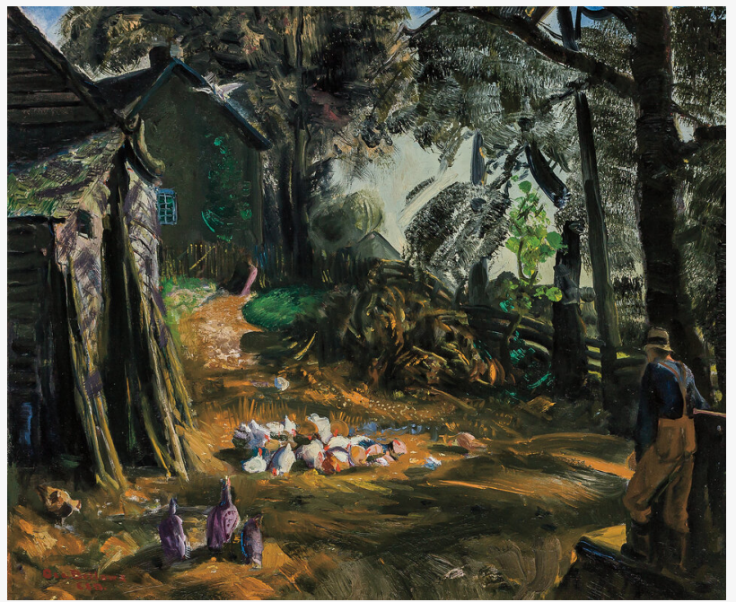
Oil on panel by George Bellows (American, 1882-1925), titled Farmer and Chickens, Woodstock , October 1922, signed, 20 inches by 24 inches ($106,250).