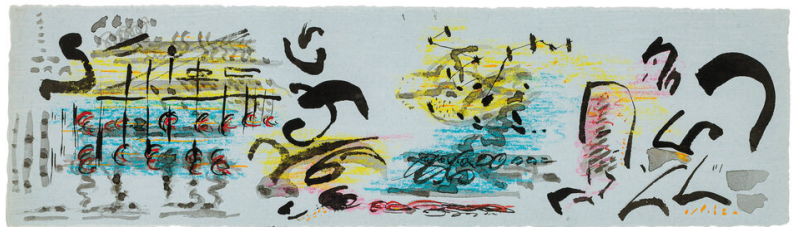
Ink and gouache on light blue paper by Jackson Pollock (American, 1912-1956), Untitled (1952-1956), 3 ½ inches by 12 ½ inches ($112,500).

Two lots later, Jackson Pollock's Untitled from