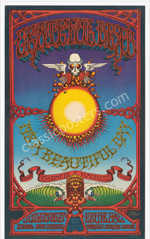
Famous and Rare AOR 3.116 Grateful Dead Hawaiian Aoxomoxoa poster. Signed by the artist, Rick Griffin.