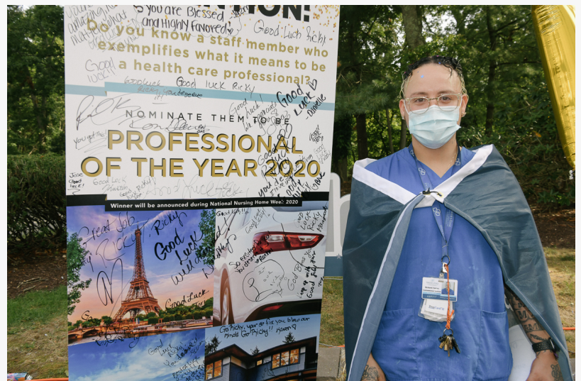
Torres Crowned the 2020 Professional-of-the-Year