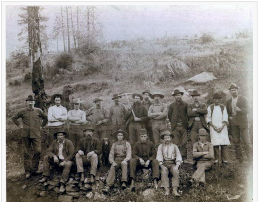
Many came west to Angels Camp in 1850s to seek Gold