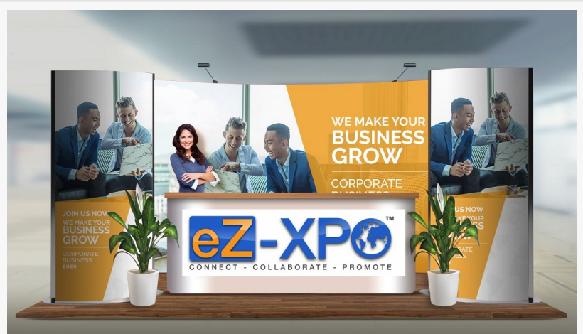
Virtual Exhibit Hall - Virtual Lobby Session Track

SAN FRANCISCO, CALIFORNIA, UNITED STATES, September 28, 2020 /EINPresswire.com/ -- San Francisco, CA., September 28, 2020 – eZ-Xpo, the global leader in All-in-1 Virtual Collaborative Network, today announced a new game-changer model (VEEA) to help every event organizer and marketers to empower all companies to dominate every niche by leveraging every event (both virtual and in-person).