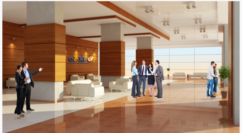
Virtual Exhibit Hall - Virtual Lobby Session Track

eZ-Xpo has been operating in San Francisco, Silicon Valley, for over five years. eZ-Xpo has deployed the world's all-in-1 virtual expo marketplace, results-oriented virtual collaborative marketing solutions for different industries and industry leaders such as Wells Fargo, New York Life, MetaStock, Boeing, and Raytheon.