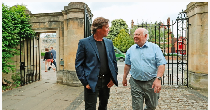
Kevin Sorbo and John Lennox Enter Green Templeton College