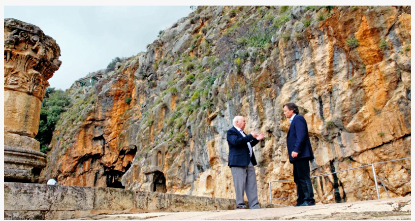
Kevin Sorbo and John Lennox Explore Caesarea Philippi

Dr. John Lennox, professor emeritus of mathematics at the University of Oxford, is an internationally renowned speaker and author. His books, which span the fields of science, philosophy, and religion, include God's Undertaker: Has Science Buried God? , God and Stephen Hawking , Can Science Explain Everything? , Gunning for God , Where Is God In A Coronavirus World? and, 2084: Artificial Intelligence, the Future of Humanity, and the God Question . Prof. Lennox has traveled the world defending the rationality of Christianity and belief in God, and has debated some of the world's most prominent atheists, including Richard Dawkins, Christopher Hitchens, and Peter Singer, among many others. Throughout, Lennox stands firm: "Properly