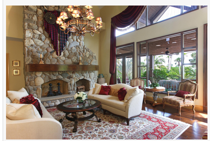
Spacious English Tudor-style home