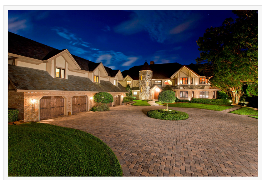
3221 SW Winding Way, Palm City, FL

NEW YORK, NEW YORK, UNITED STATES, September 29, 2020 /EINPresswire.com/ -- Located just north of Palm Beach, this stunning Palm City estate, with over 1,500 feet of waterfront, will auction online next month via Concierge Auctions in cooperation with Kim Spears of Douglas Elliman Real Estate. Currently listed for $4.49 million, the home will sell No Reserve October 27–29th via Concierge Auctions' online marketplace, ConciergeAuctions.com, allowing buyers to bid digitally from anywhere in the world.