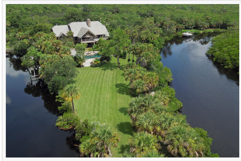
1,500 feet of waterfront with boat access to ocean