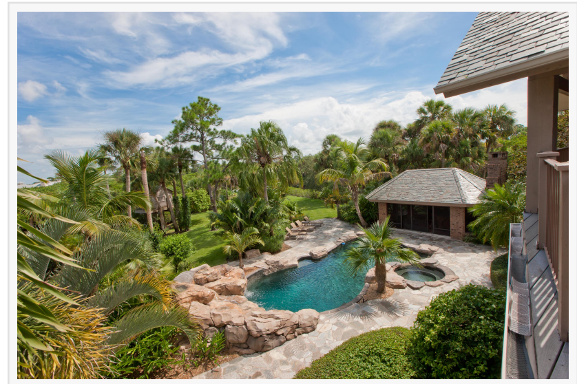
Saltwater pool and spa with abundant entertainment space

Beach, under an hour north, where manatees and dolphins roam off the shores of the stunning white sand beaches. Just a short drive or boat ride south lies the resort town of Jupiter, home of numerous professional golfers on the PGA Tour, with picture-perfect beaches, innovative restaurants, high-end retailers, and thrilling water sports. Palm Beach International Airport is also less than one hour away, where you can jet off to seek adventure anywhere in the world.