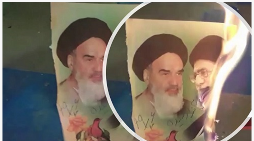
Arak - Torching posters of Khomeini and Khamenei - September 2020