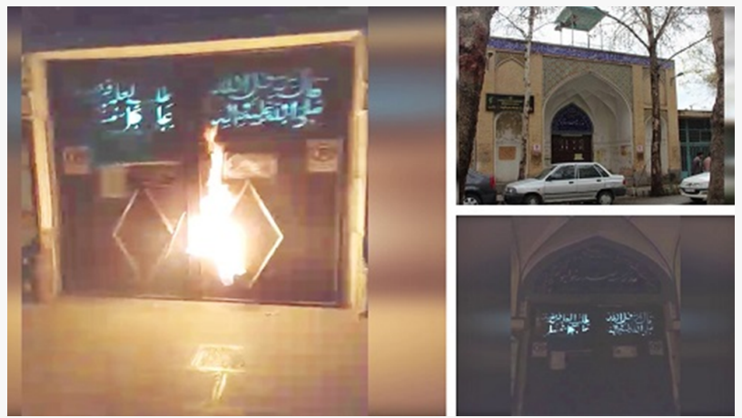
Isfahan – Torching the entrance to the repressive Basij force - September 29, 2020