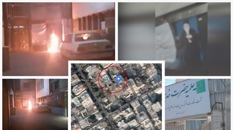
Mashhad – Targeting the center for spreading terrorism – September 2020