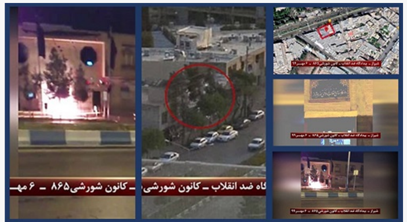
Shiraz- Targeting regime's court in Shiraz, which sentenced Navid Afkari to death – September 2020