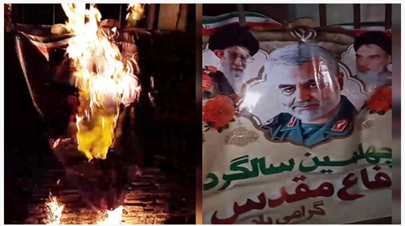
6-Lahijan - Torching the eliminated Quds force commander, Qassem Soleimani's banner - September 29, 2020