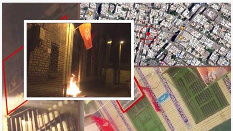
Tehran – Torching the center for the repressive Basij - September 29, 2020

PARIS, FRANCE, September 30, 2020 /EINPresswire.com/ -- During the past week, defiant youths in Tehran, Shiraz, Isfahan, and Mashhad set fire to centers of repression and terrorism to protest the execution of Navid Afkari , Iran's wrestling champion arrested during the 2018 uprising. The defiant youth also set fire to the pictures of Khamenei and Khomeini and the terminated commander of the terrorist Quds Force, Qassem Soleimani , in several cities, including Arak, Iranshahr, and Khaf (Khorasan Razavi).