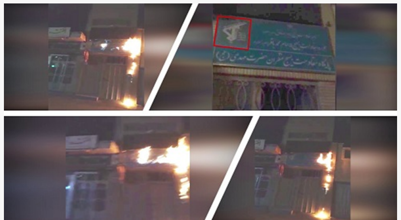
Isfahan- Torching two IRGC centers of repression - September 29, 2020