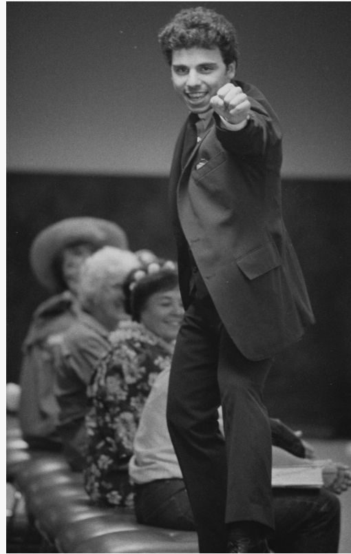
Herbie J Pilato entertains the audience members for "The Tonight Show" in September 1984

https://www.amazon.com/gp/product/159393131X/ref=dbs_a_def_rwt_hsch_vapi_tpbk_p1_i6