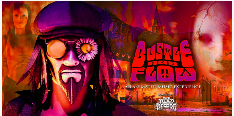
“BUSTLE AND FLOW” A NEW ANIMATED MUSIC EXPERIENCE Powered by The Dead Daisies

The Dead Daisies are always looking for original ideas and providing unique experiences for their fans. This new offering taps into the gaming aesthetic that dominates the globe and enables the band to connect with audiences of all ages, whilst remaining on the cutting edge of technology.