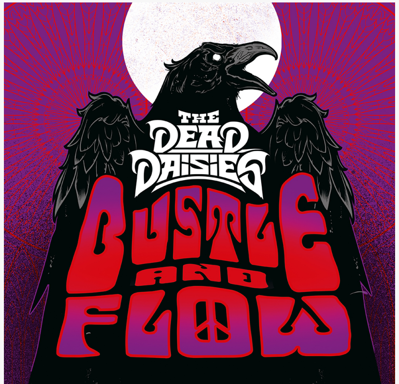
“BUSTLE AND FLOW” The new single by rock band The Dead Daisies available to download and stream now!