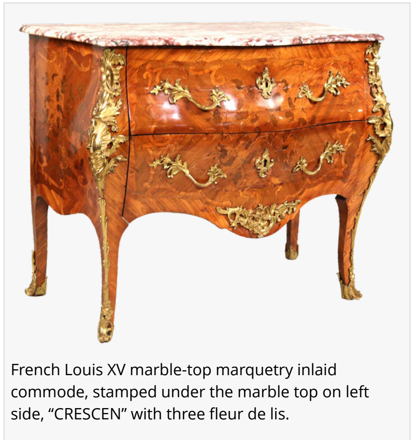
French Louis XV marble-top marquetry inlaid commode, stamped under the marble top on left side, “CRESCEN” with three fleur de lis.