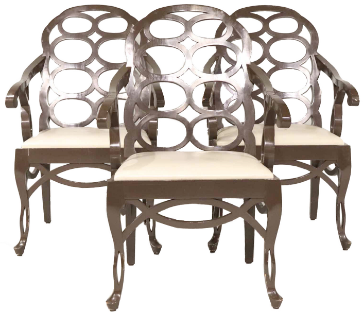
Set of twelve Francis Elkins brown lacquer armchairs.