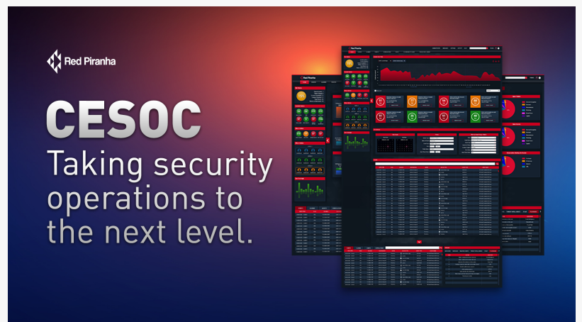
Red Piranha takes cybersecurity to the next level, launching CESOC, an XDR security operations centre with integrated MDR capabilities.

Featuring integrated SIEM, Incident Response and Forensics, Vulnerability Assessment, automated patching and integrated Risk Management capabilities, CESOC delivers cutting edge threat intelligence in real-time, allowing for an actionable defence to be implemented in operating environments.