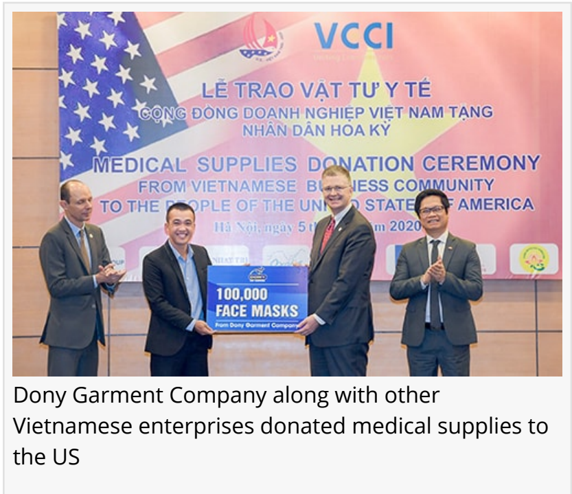
Dony Garment Company along with other Vietnamese enterprises donated medical supplies to the US

DONY’s Disposable Protective Coverall is designed to provide head-to-toe protection while