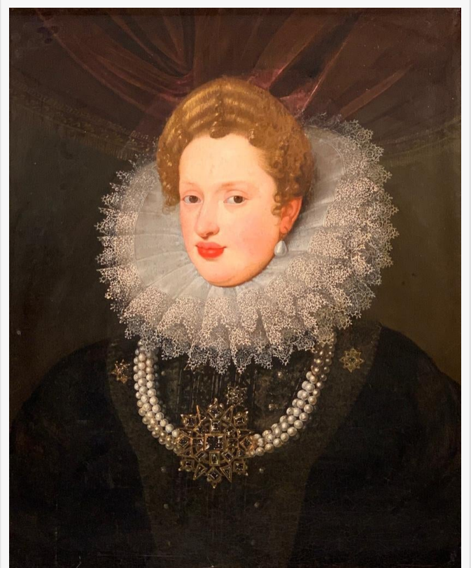
Stunning 17th century English, Netherlands or Spanish School oil portrait of a Royal or Court Lady, unsigned and unframed, with a panel size of 27 inches by 22 inches ($14,760).

Neue Auctions provides a bespoke experience for sellers and buyers, with items presented fully guaranteed and vetted, and combines regular online auctions with selected art exhibitions and educational opportunities. Offering consignment services for single items, estates and corporate collections, the firm assists clients in the complicated process of settling estates and general downsizing, working with private individuals, trusts, estates, museums, banks and attorneys.