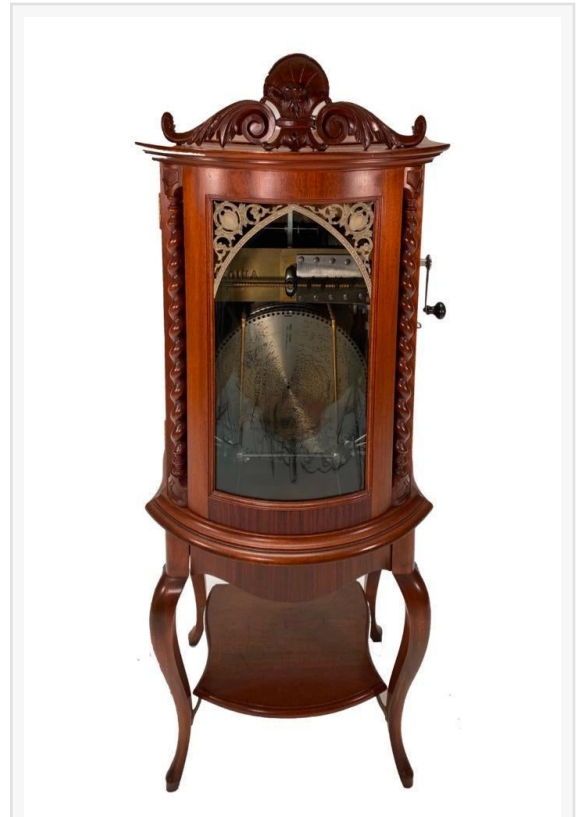
Circa 1880 Regina upright automatic disc box, 5 feet 7 inches tall, with 20 15 ½ inch discs, in fine playing condition, in a cabinet that had been restored and refinished ($9,225).

Cynthia Maciejewski Neue Auctions +1 216-245-6707 email us here