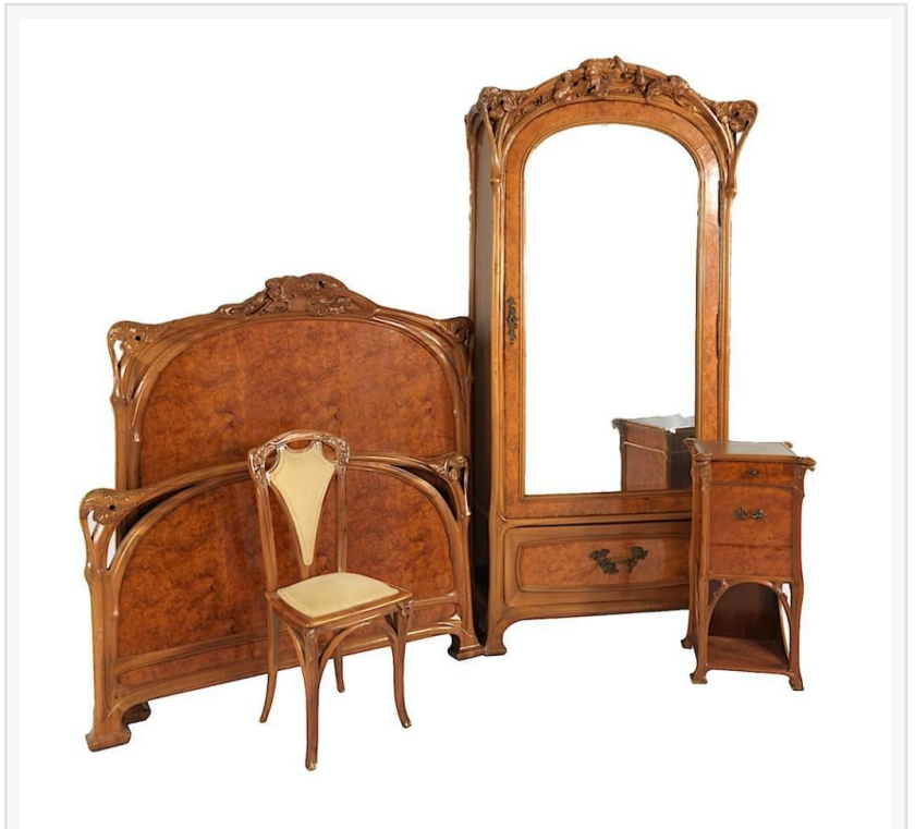
Assembled Art Nouveau bedroom suite attributed to Eugene Vallin, including a bed frame, large armoire, side table and chair, carved with leaves, buds and tendrils ($9,225).

This press release can be viewed online at: https://www.einpresswire.com/article/527733415