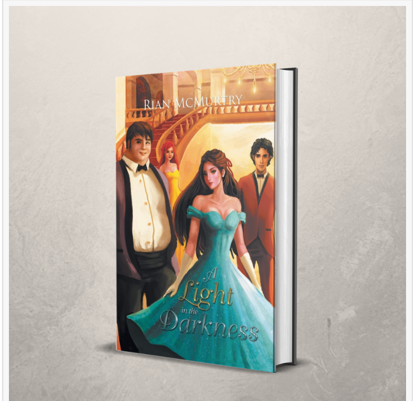
A Light in the Darkness