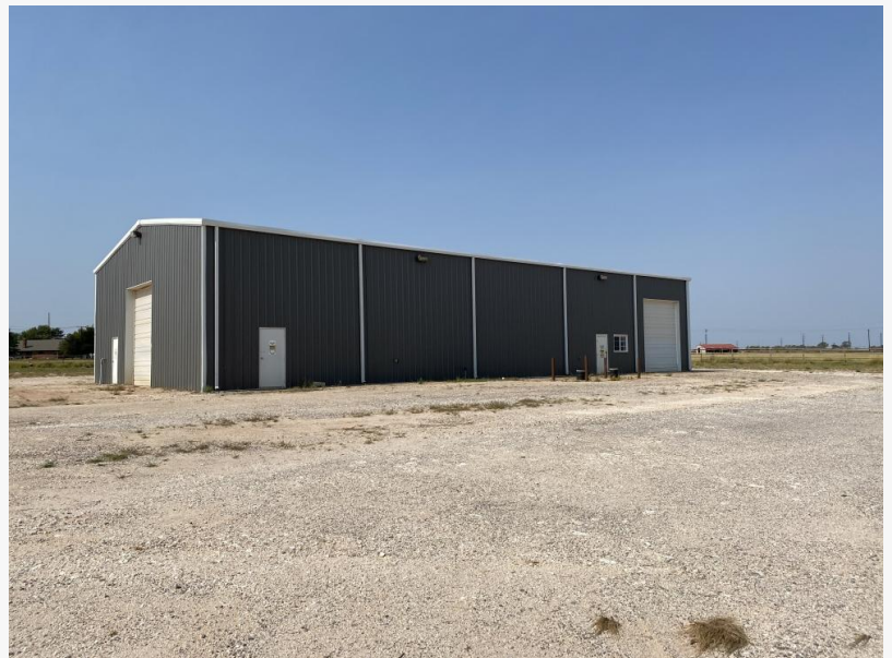
7775 HWY. 83, Wheeler, TX