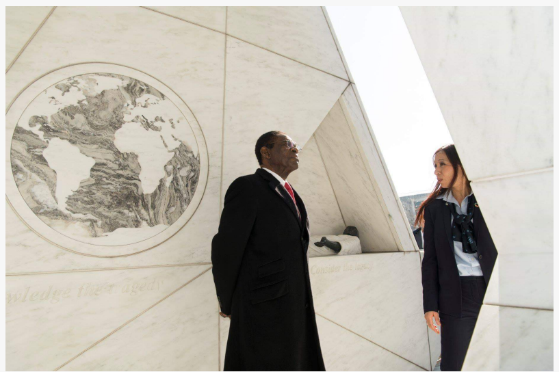
President of Equatorial Guinea visits Arc of Return at United Nations Headquarters' in New York City.