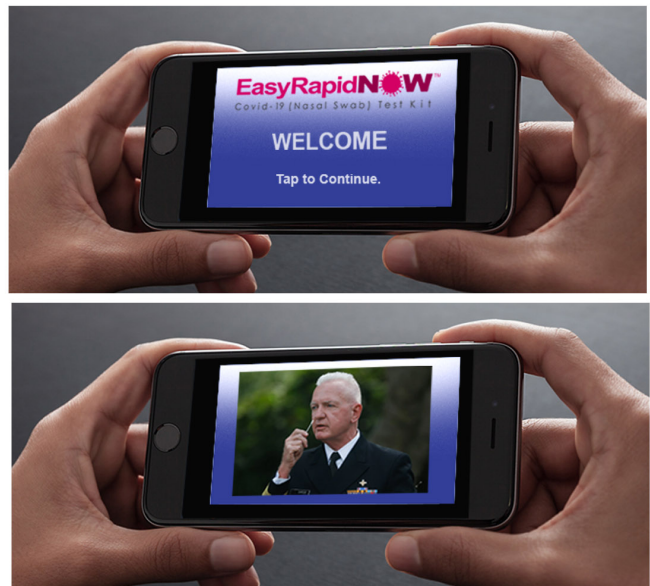
Video Passport® Mobile App and Video Tutorial Demonstration

Video Instruction Tutorial & Mobile App, helping to restore freedom and confidence to our lives in our new normal.