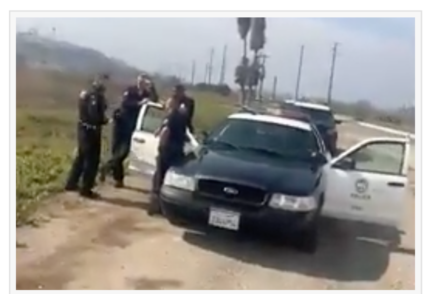
Several squad cars converge on Ballona Wetlands Ecological Reserve

PLAYA DEL REY, CALIFORNIA, USA, October 6, 2020 /EINPresswire.com/ -SHOWDOWN AT WETLANDS: 5 LAPD OFFICERS vs. ONE ENVIRONMENTAL ACTIVIST... AND IT'S ALL CAUGHT LIVE ON FACEBOOK! FOSSIL FUEL INDUSTRY CALLS COPS ON LA CITY COUNCIL CANDIDATE DOCUMENTING INDUSTRY ACTIVITIES AT THE BALLONA WETLANDS IN MIDST OF A TUG OF WAR OVER WILDLIFE HABITAT'S FUTURE!