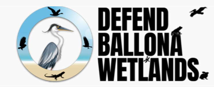
Defend Ballona Wetlands Logo