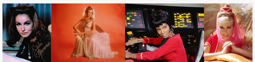
Julie Newmar, Elizabeth Montgomery, Nichelle Nichols, and Barbara Eden are profiled in GLAMOUR, GIDGETS AND THE GIRL NEXT DOOR

The distinguished Diahann Carroll delivered a barrier-and race-breaking performance as "Julia" in the same-named, first-African-American-led sitcom in TV history.