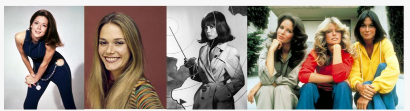
Diana Rigg, Peggy Lipton, Stefanie Powers, Farrah Fawcett, Jaclyn Smith, and Kate Jackson shine bright in Pilato's GIDGETS guide

LIFE AND CAREER OF ELIZABETH MONTGOMERY and DASHING, DARING AND DEBONAIR : TV'S TOP MALE ICONS FROM THE '50s, '60s, and '70s, among others).