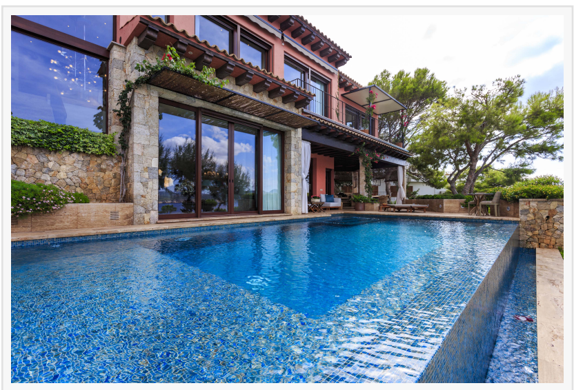
This gorgeous Mallorcan villa sits perched on a cliff overlooking Santa Ponsa Bay and the Mediterranean sea.

LONDON, ENGLAND, UNITED KINGDOM, October 7, 2020 /EINPresswire.com/ -- Perched on a cliff overlooking Santa Ponsa Bay and the Mediterranean Sea in Mallorca, Spain, Ca'n Zen will auction online via Concierge Auctions in cooperation with Sergey Kotrikadze of Imperial Properties. Currently offered for €5.95 million, bidding will culminate 12 November via Concierge Auctions' online marketplace, ConciergeAuctions.com, allowing buyers to bid digitally from anywhere in the world.