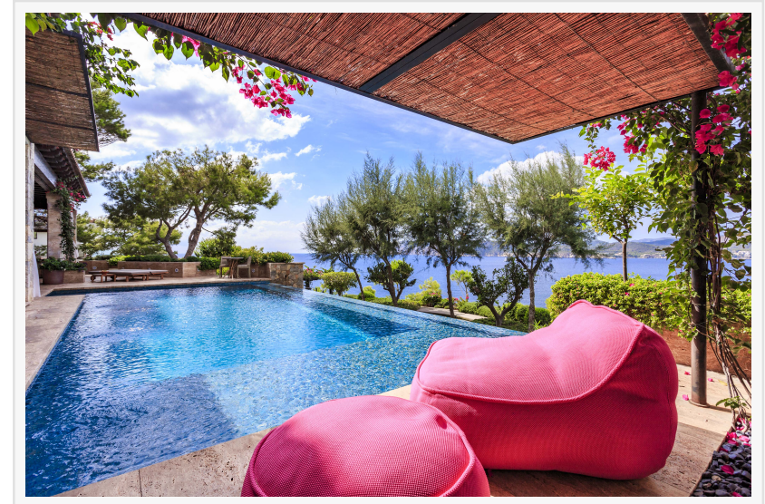
Enjoy the picturesque and spectacular sunsets from the expansive outdoor terrace with a glass of wine. Luxuriate in an infinity-edge pool that seems to blend into the ocean.

Krystal Aeby Concierge Auctions +1 212-202-2940 email us here