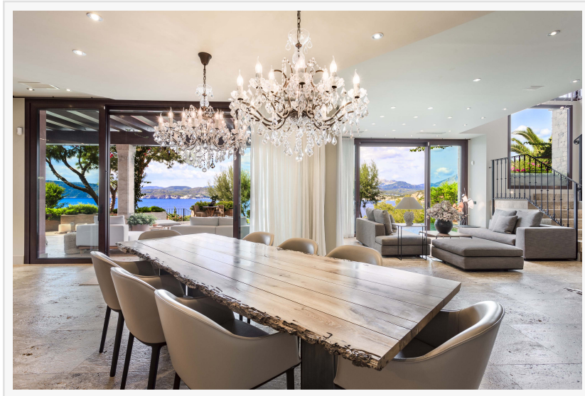
The spectacular scenery, enjoyed from every room in the villa, resembles a painting.

About Concierge Auctions Concierge Auctions is the largest luxury real estate marketplace in the world, powered by state-of-the-art technology. Since its inception in 2008, the firm has generated billions of dollars in sales, broken world records for the highest-priced homes ever achieved at auction, and is active in 41 U.S. states/territories and 29 countries. Concierge curates the most prestigious properties globally, matches them with qualified buyers, and facilitates transparent, market-driven transactions in an expedited time frame. The firm owns the most comprehensive and intelligent database of high-net-worth real estate