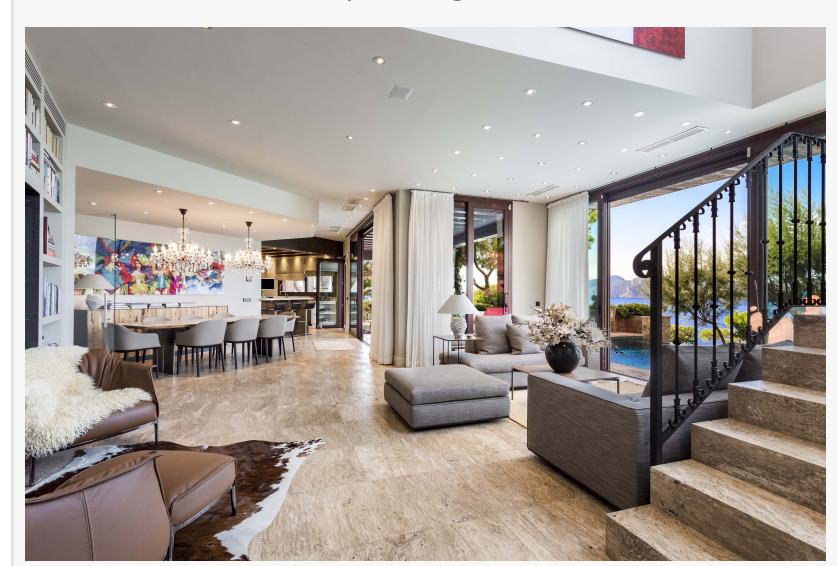
Beyond the luxurious finishes, state-of-the-art home technology adds convenience and comfort.

buyers and sellers in the industry. As a six-time honoree to the annual Inc. Magazine list of America's fastest-growing companies, it now joins the Inc5000 Hall of Fame; was named No. 38 on the 2018 Entrepreneur 360™ List recognizing 360 small businesses every year that are mastering the art of and science of growing a business in the areas of impact, innovation, growth, leadership, and business valuation; and has contributed more than 200 homes to-date as part of its Key for Key® giving program in partnership with Giveback Homes™, which guarantees that for every property the company sells, a new home will be built for a family in need. For more information visit conciergeauctions.com.