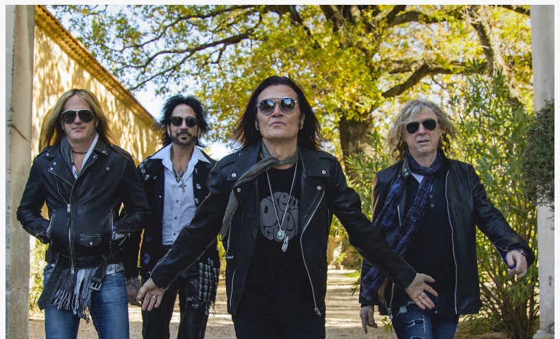
The Dead Daisies

They're influenced by rock sounds of the 70s and 80s and have learned to adapt to stay relevant and fresh. Whether they're releasing quarantine EPs or adding the titan of music, Glenn Hughes (also known as "The Voice Of Rock"), to the group, they maintain their timeless appeal and cause nostalgia for the rock-n-roll era. They've headlined shows internationally and have shared the stage with legends like Kiss, Guns N 'Roses, and Scorpions. They even hold