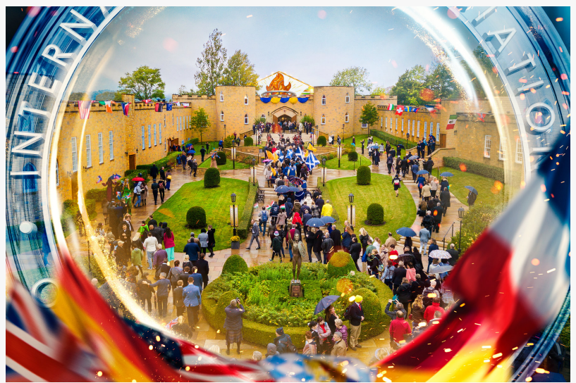
Lasst years gathering for the IAS Anniversary in England

The Foundation Pluralismo y Convivencia according to its website “is a public sector institution within the Ministry of the Presidency of Spain. Its mission is to anchor the recognition and acceptance of religious diversity as basic elements of peaceful coexistence, dialogue, and thus the complete guarantee of religious freedom in Spain”. It supports the implementation of religious and denominational projects. It also collaborates with the representative bodies of the religious denominations in order to guarantee for their members the unrestricted practice of their