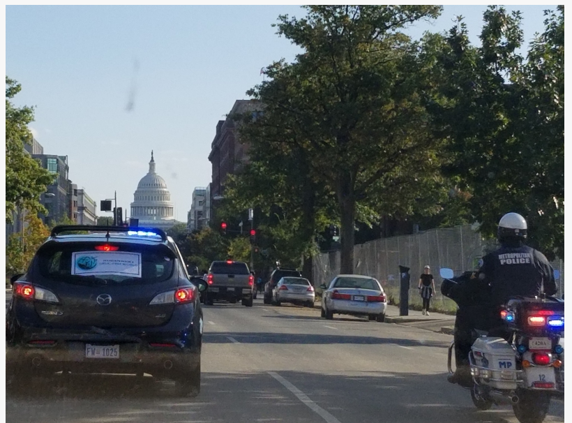
National Night Out caravan moves throughout the city of Washington, DC