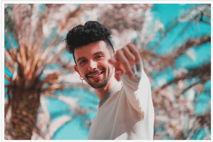
We strive to put your interests first

yourself then are these – where will this job take me, and is this what I want to do?