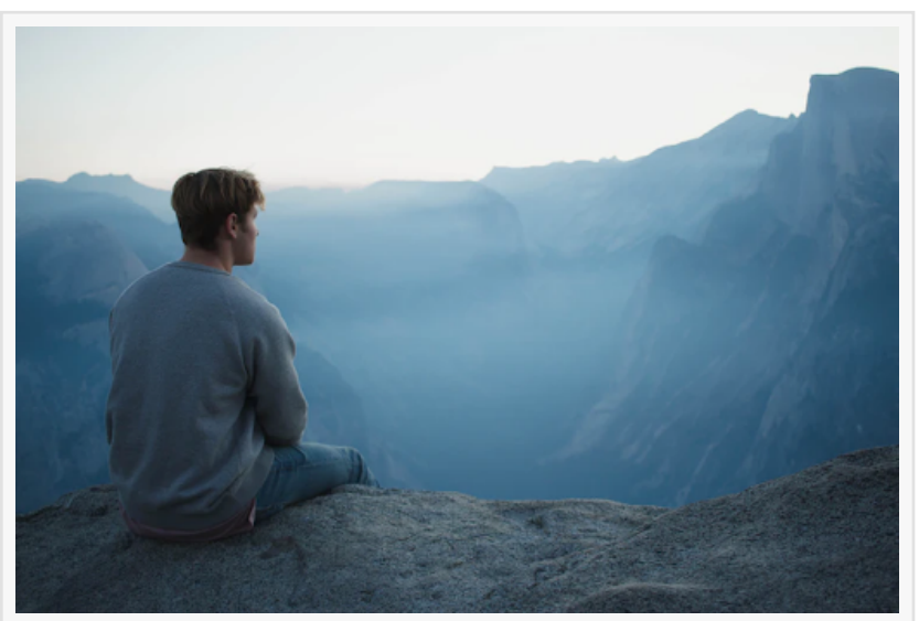
Are you really satisfied with your work?

Is Your Recruiter Focusing on Your Interests and Goals?