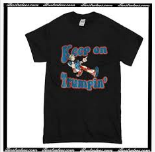
Trump Shirt & Specialty Product Buyers Lists

Sprint Data Solutions Worldwide Marketing got into the business before digital marketing was more common by working in the direct mail market. This laid the foundation for a valuable work strategy of data acquisition and curation crucial for any marketing approach. This area's success led to Sprint Data Solutions Worldwide Marketing to expand its range of services and a natural expansion into the digital marketing arena, where database management and analytics became even more crucial to success.