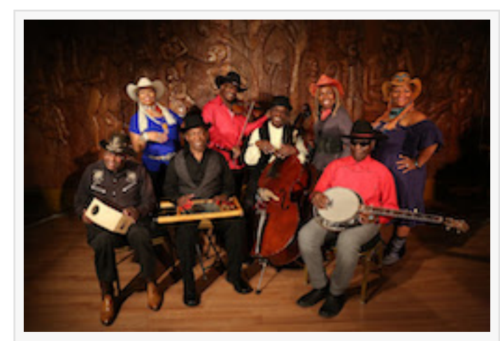
THE EBONY HILLBILLIES

From the street corners of Manhattan to the hallowed stages of Carnegie Hall and Lincoln Center to TV appearances on the BBC and ABC's