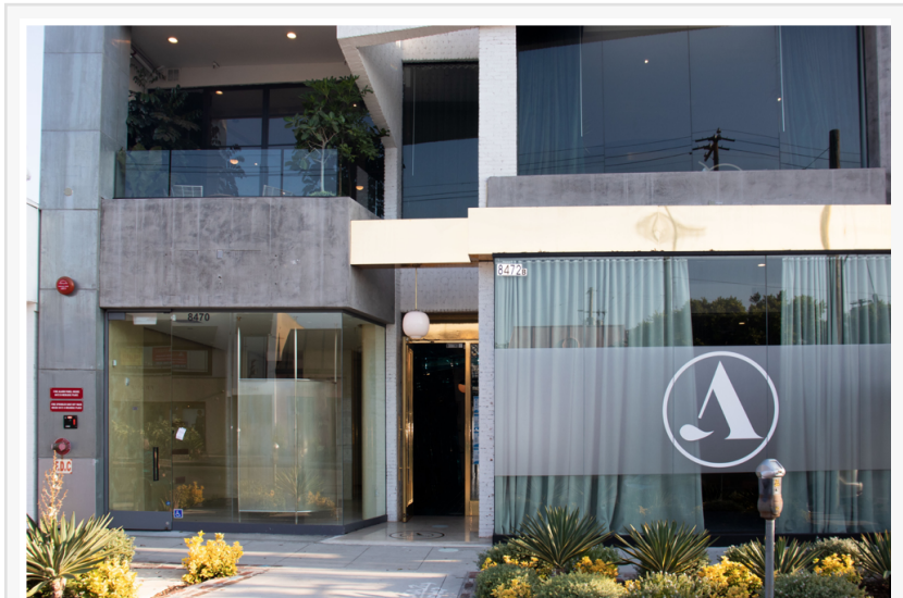
Dr. Refresh Launches New Wellness Center at Melrose Place in Los Angeles

With wellness at the forefront of 2020, Dr Refresh's new wellness center has got you covered. In addition to popular vitamin IV drip infusion therapy, Dr. Refresh's new Los Angeles location will