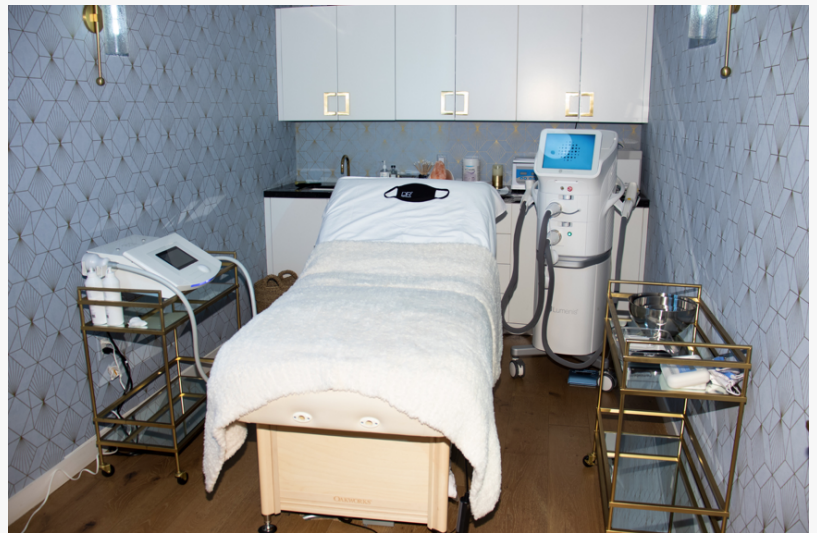
One of the treatment rooms at Dr. Refresh in Los Angeles