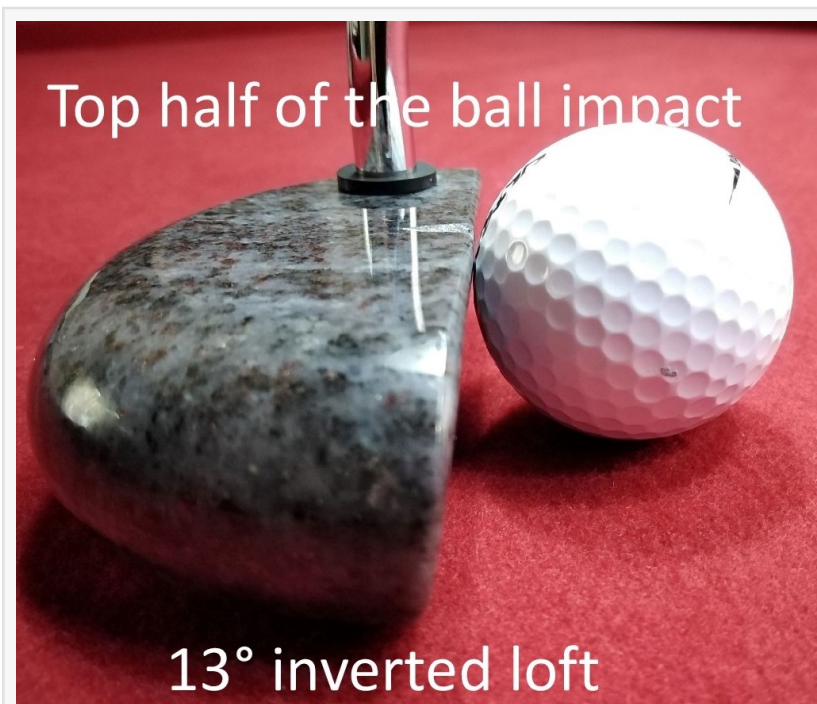
Ball rolls from the top

The putter grip can be chosen at time of purchase with such names as, Jumbo Max and Super Stroke. Or any other grip customers would like to choose.