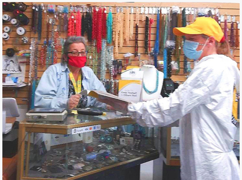
Volunteer Ministers have handed out more than 7,000 copies of Stay Well booklets in English and Spanish.