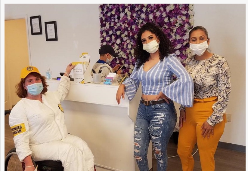
A local boutique displays the booklets for customers to take copies for themselves and their friends and families.