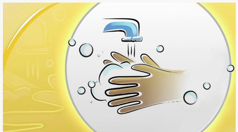
Hand washing is one of the most effective measures for containing the virus