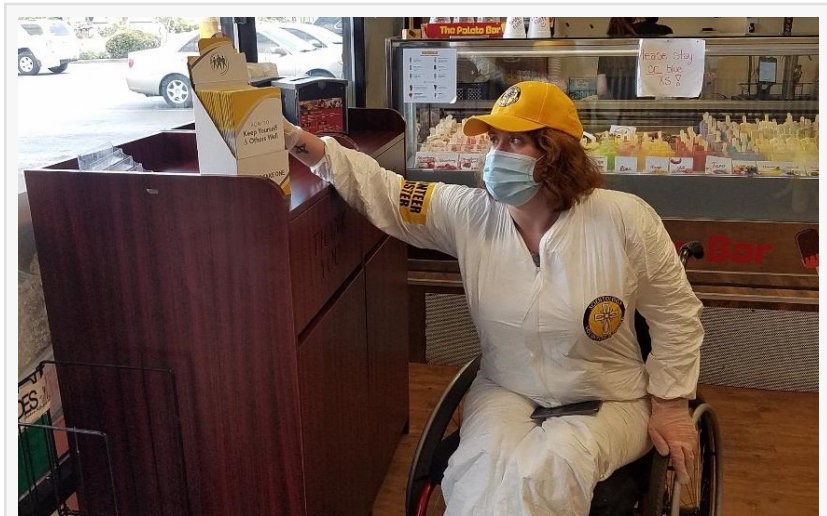
Albuquerque Volunteer Ministers began their Stay Well campaign in May.

“This is needed and some people just don’t get it,” said a healthcare professional. She said that with their illustrations and simple language, the booklets can help people understand why it’s