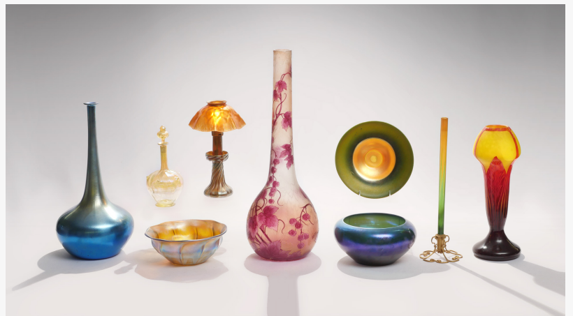
The major art glass collection in the sale includes outstanding pieces by Steuben, Tiffany, Galle and LaVerre Francaise.