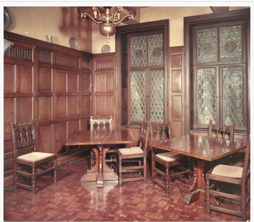
The Jacobean Room from the St Petersburg Museum of Art installation. 1600's architecture from a gabled house in London and later housed in the Schenley World Headquarters in the Empire State Building in New York City as one of the executive dining rooms.

One of the rooms, called the Georgian Room, was built during the Georgian period (1714-1830), during the reign of the Georges. The circa 1740 room is fully paneled, with a fireplace mantel, and surrounds a 560-square-foot area. It was originally from the Bull Inn, Guild Hall, London.