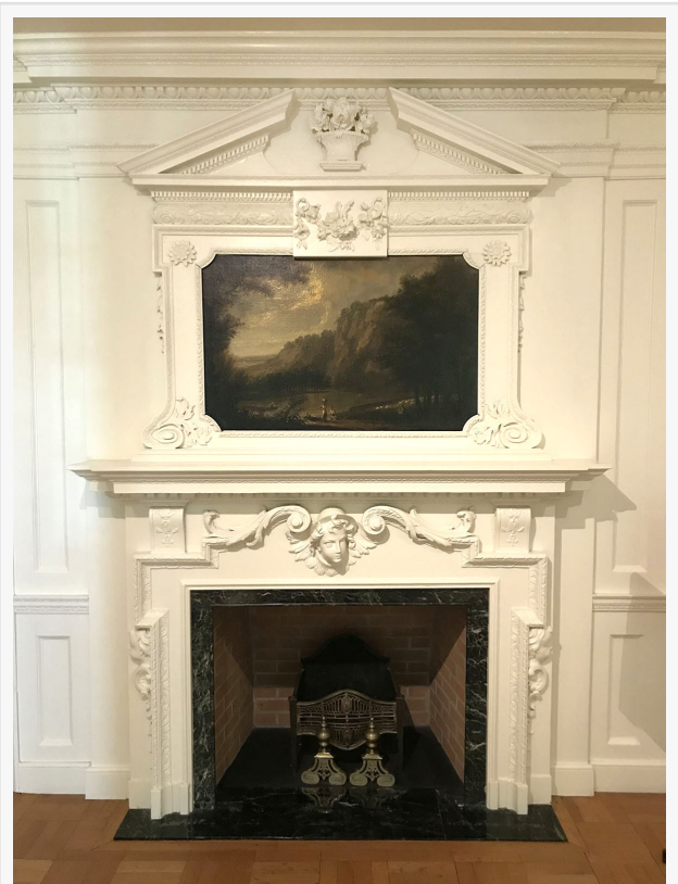
Full paneled Georgian Room from the installation at the St Petersburg Museum of Art, originally from the Bull Inn (London) and later housed in the Schenley World Headquarters as an executive dining room in the Empire State Building, New York City. Circa 1

The list continues with important paintings, prints and sculptures by listed artists, to include Anthony Thieme (Dutch, 1888-1954) and Peter Max (German-American, b. 1937), plus vintage