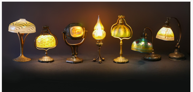
Art glass lamps will include examples by Tiffany, Handel, LeGras and more.