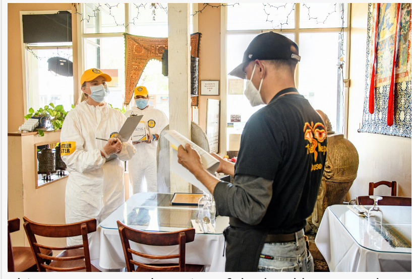
This restaurant took copies of the booklets to make them available to their customers.