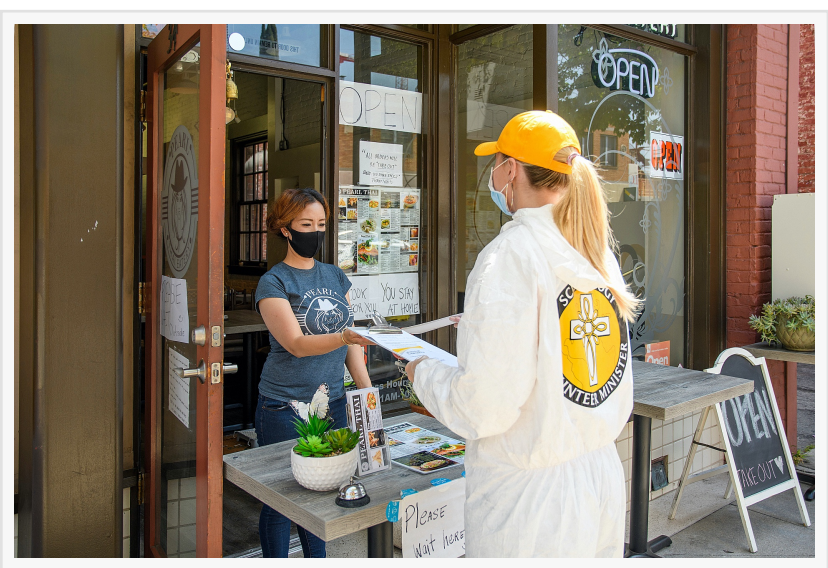
Volunteer Ministers from the Church of Scientology Pasadena bring Stay Well educational booklets to local restaurants and bistros.