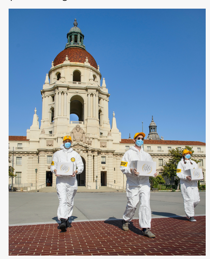
Pasadena Volunteer Ministers began distributing Stay Well booklets in May.

Volunteer Ministers provide simple educational booklets to local stores who share them with their customers so everyone can understand and practice basic prevention guidelines.