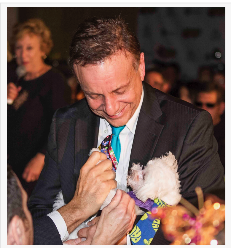
Dogs Are Why The Company Was Created

The latest medical opinions state that even 6 feet is not enough for social distancing, and mention that breathing droplets can travel three times the distance. The easiest way to catch COVID is to breathe in the virus. A recent article illustrated that an abandoned home had COVID, that had entered through water droplets in the sewage system (https://www.bloomberg.com/news/article s/2020-08-26/coronavirus-in-vacantapartment-suggests-toilets-role-in-<u>spread</u>); one cannot take any risks as we never know which of us will be fatally affected; many young persons have perished, not just our senior members. Antonio Stefano masks are available in 15 Italian designs for a world-class look. The