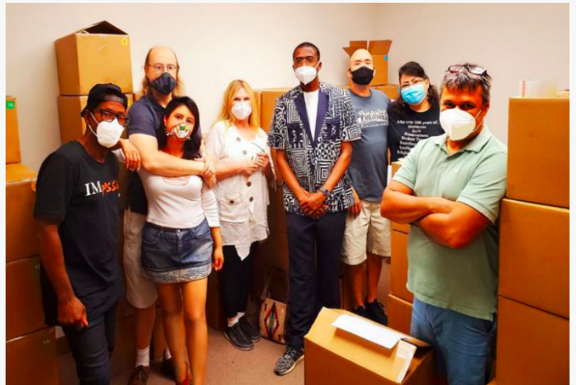
Masks for Life - Memnosyne Institute Team