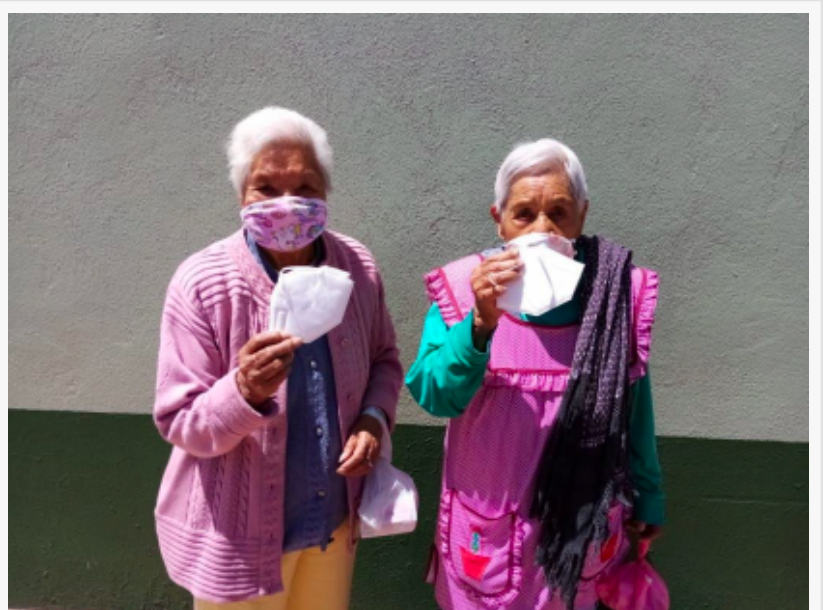
Masks for Life - Tribe Elders