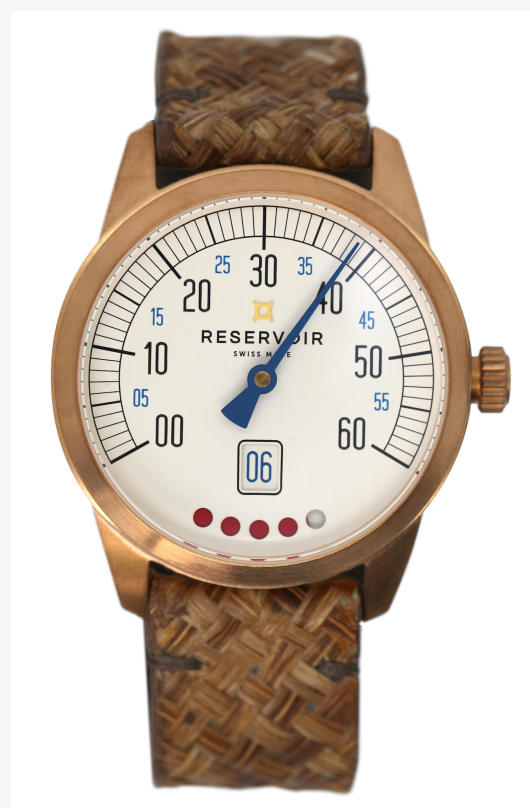
Reservoir Tiefenmesser with Plume Bracelet

The feather bracelets are braided and assembled by a feather craftsman in a workshop in Paris, France. A feather craftsman or Plumassier prepares bird feathers for ornamental use or who produces feather works. The preparation of feather bracelets takes place in several stages, the whole operation taking ten hours. The "Plumassier" selects the feathers according to their qualities, namely the width and the color. The technique continues with the gluing and drying of the feathers chosen, thus ensuring their hold during the work. The craftsman calibrates them and initiates a ligature or braiding according to precise know-how, then cuts the braided element according to the bracelet's template. The braided and measured element is then assembled on pre-cut leather, then undergoes a pampering finish. A slice wax is then applied. Finally, the double-folding buckles, clasp, and pumps are then fitted according to the models. A manual and visual inspection is then applied, thus ensuring a high quality of the work.