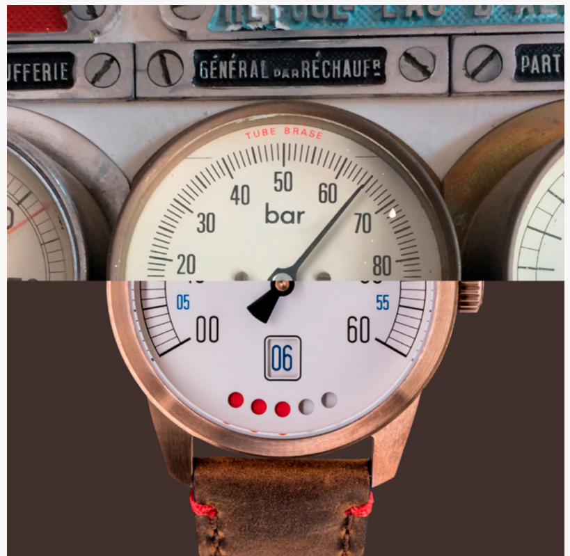
Reservoir takes its inspiration from vintage gauges