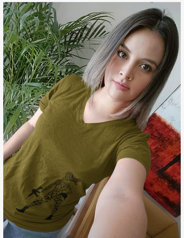
Verve United Freedom Sisters t-shirt