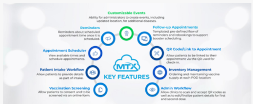
MTX Group Vaccine Management Features

MTX recently collaborated with the City of Chicago to launch the first of its kind cloud-based vaccination management solution in the U.S., called GETVAXCHI, to prepare for the upcoming flu season and the COVID-19 vaccine release.