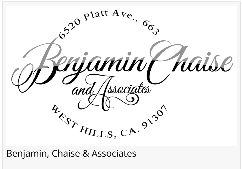
Benjamin, Chaise & Associates

With a trained team of expert debt collectors, Benjamin, Chaise & Associates have successfully recovered business debts for many small scale business owners. Their contingency debt collection approach has made them the best agency one can look up to.