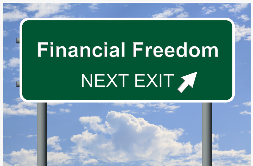
Benjamin, Chaise & Associates

This press release can be viewed online at: https://www.einpresswire.com/article/528492635