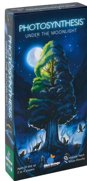
Photosynthesis: Under the Moonlight

Beyond the capabilities of the original Photosynthesis game, the expansion enables players to