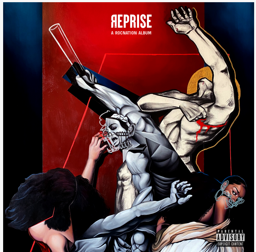
Reprise Album Cover art.