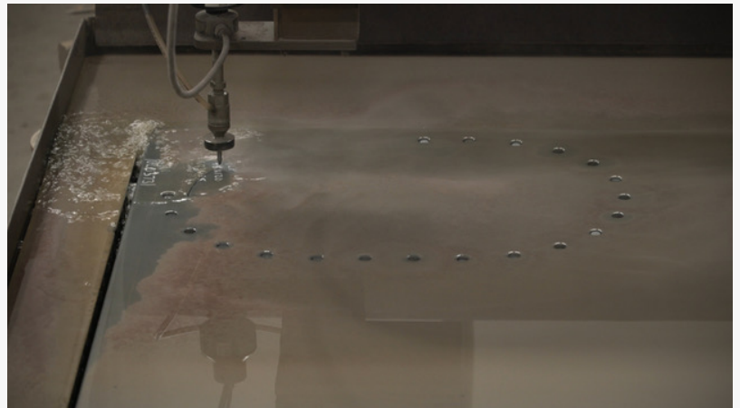
Waterjet uses high pressure to cut holes

A waterjet is specialized equipment that utilizes high-pressure water streams to make precision cuts out of raw materials as varied as titanium, carbon fiber epoxy, all-metal alloys, and elastomers. Waterjet cutting is fast, powerful, and precise. The final product will be free of burrs and has a finished quality like no other. It is used to