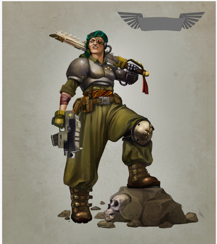
General Nefret Azima