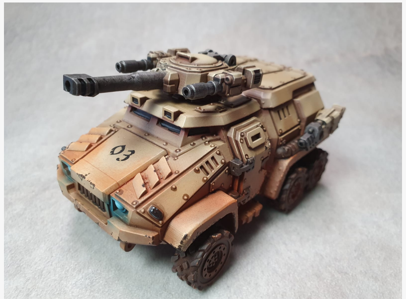
Printed Qirkirin assault vehicle

This press release can be viewed online at: https://www.einpresswire.com/article/528598464